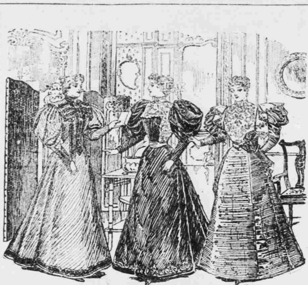
CHEVIOT, CREPON AND MOIRE GOWNS.