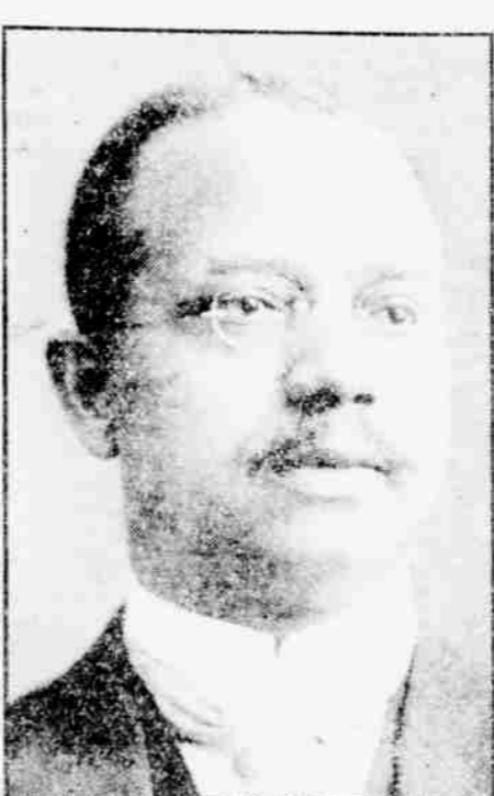
HON. CHARLES A. COTTRILL

Developments of a day in the matter of the threatened appointment of the Hon. Charles A. Cottrell, of Toledo, Ohio, as collector of internal revenue for Hawaii indicate that the appointment will be made by President Taft unless some other plan for the Toledo position can be found.