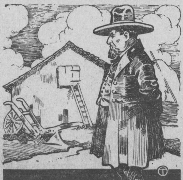
PLOUGHING TIME AGAIN. Soft rains and warming suns have forced the land and forced King Frost back to his northern clime; The farmer at the field's edge takes his stand And tells his son 'twill soon be ploughing time. Find his son. ANSWER TO YESTERDAY'S PUZZLE Upper left corner down, nose at hands.