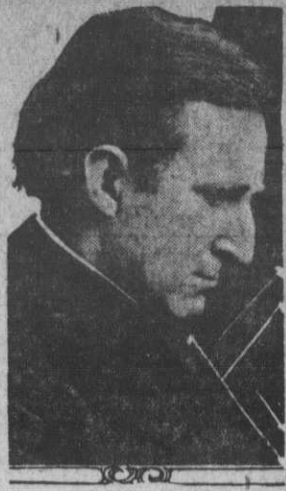
Frank J. Marshall.

Frank J. Marshall, of New York, chess champion of the United States, recently broke two world records in competing with 105 of Washington's best players. He passed rapidly from table to table, keeping track of the 105 games with apparent ease. He won 82, lost 6 and drew 15 of the games.