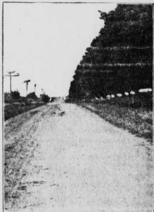
Brick or Concrete Roads Are Economical if There is Considerable Heavy Traffic.

horse-drawn vehicles, a light traffic of automobiles, and a light traffic of heavy trucks.