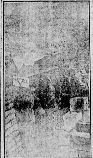
A Red Triangle Dugout in the Trenches.

That price is not the first thing to be considered in a job of printing! Throwing type together in a haphazard way does not require any knowledge of the printing art. That isn't the kind of work you want. But artistic typography in stationery and advertising reflects credit to any concern. Our knowledge of printing gained by long experience enables us to produce Attractive Printing for Every Purpose. Don't order anything in this line until you call on us.