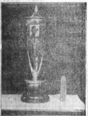
Form 1 The W. K. Kellogg National Corn Trophy