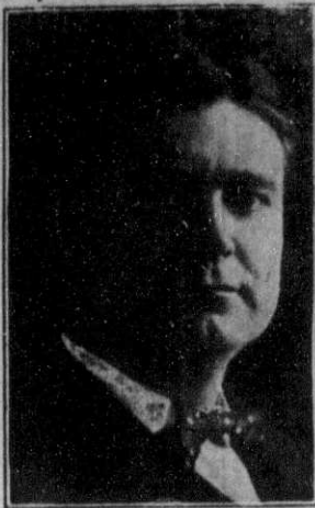
HON. W. E. BORAH Idaho's Distinguished Citizen usually receives the almost unanimous vote of the people of the Meridian community, of whatever party or faith. This year is no exception. Let us rally to the support of Idaho's senior Senator.