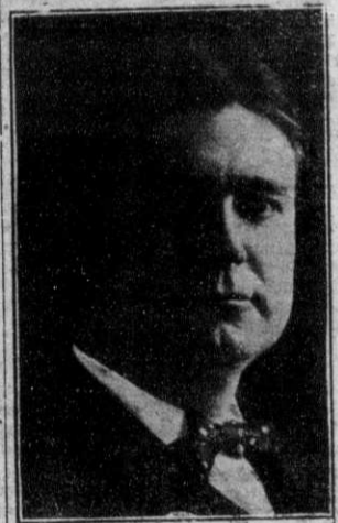
Senator W. E. Borah, of Idaho, Who Wins Distinct Triumph for Anti-Administration Forces.

Remember the meeting of the Boise Valley Holstein Cattle men will be held in Meridian Monday evening, March 31 for the purpose of organizing a Holstein breeders cattle club. The purpose of the club will be to further the interests of Holstein breeders in buying cooperatively and disposing of their surplus cattle. A Jersey club was organized a short time ago and since organizing thirty pure bred Jerseys have been brought into the valley. All owners of Holstein cattle are urged to be present.