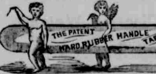
TABLE KNIVES AND FORKS OF ALL KINDS, AND ORIGINALLY EXCLUSIVE MAKERS OF

And exclusive makers of the "Patent Ivory" or Celluloid Knife. The most Durable White Handle Knives. The Handles never get loose, are not affected by hot water. Always call for the "Trade Mark" MERIDEN CUTLERY COMPANY on the blade. Warranted and sold by all dealers in Cutlery, and by the MERIDEN CUTLERY CO., 4 Chambers Street, New York.