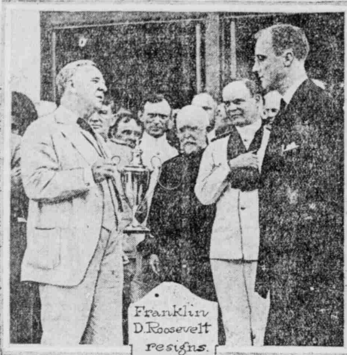
Secretary of the Navy Josephus Daniels, presenting Franklin D. Roosevelt, Democratic Vice-Pridential candidate, with a silver loving cup upon the occasion of the latter's retirement from his duties as Assistant Secretary of the Navy. The presentation took place in front of the Navy Building in Washington and was witnessed by hundreds of Navy Department employees.