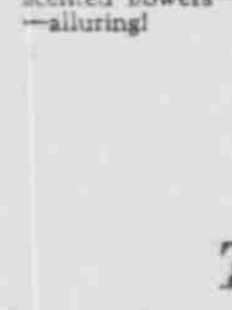
LURA Toilet Water—Just a breath of sweet-scented flowers—elusive—alluring!

QUEL magic est-il? What magic is this? All day in sun and wind—burning—drying! Mais, behold! It is morning—and Madam is marvelous! Fresh as dew diamonds—pink as the petal of the primrose! What delight to see her so!