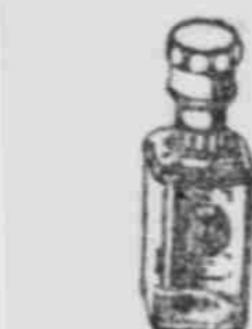
LURA Massage Cream—Preserves Youth—priceless possession!