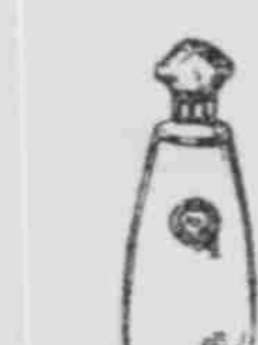
LURA Henna Shampoo—The gleam of sunlight for your tresses!