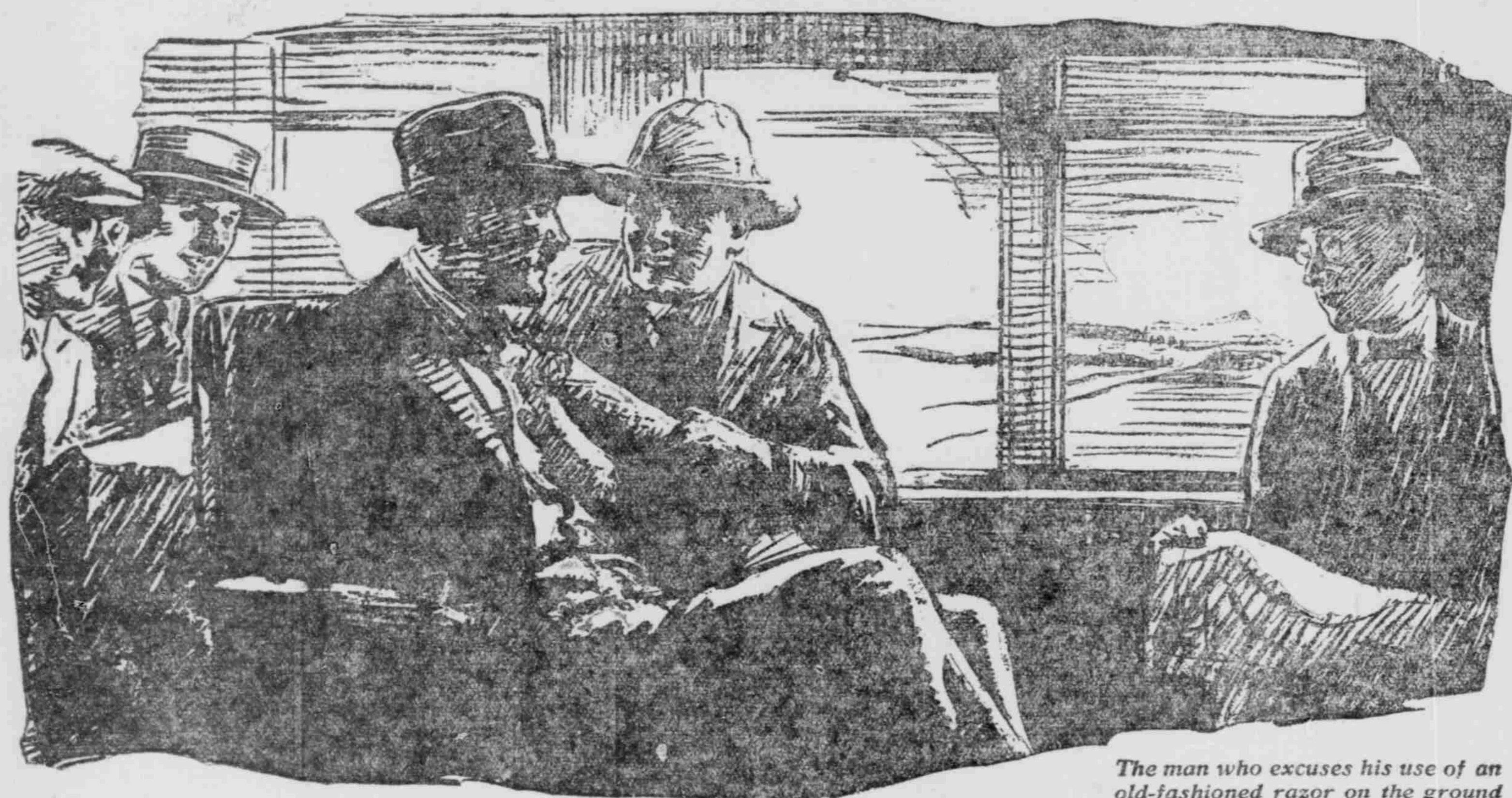
The man who excuses his use of an old-fashioned razor on the ground that he has a tender skin and a wiry beard, often tells this to a safety razor user who has a much more difficult face to shave.

ONE of the most surprising reversals of opinion ever known in the history of shaving has suddenly come about.