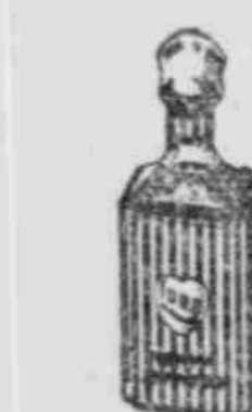
LURA Perfume—Exquisite blends of flower fragrance!