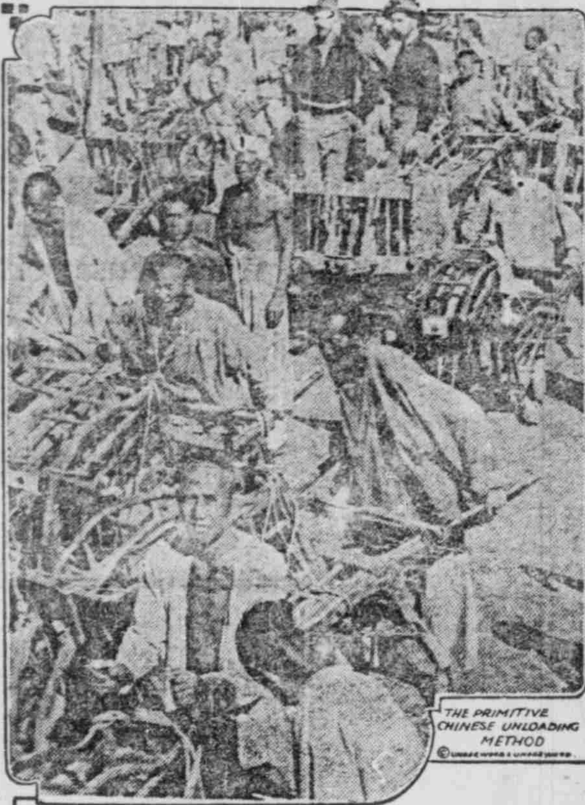
THE PRIMITIVE CHINESE UNLOADING METHOD