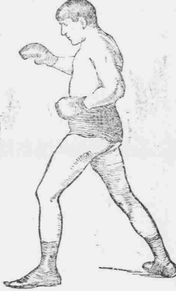
JIM CORBETT, WHO WILL AGAIN FIGHT FITZSIMMONS.

The SPORTING WORLD The Corbett-Fitzsimmons Match. The Fitzsimmons-Corbett match has aroused great interest throughout the country. It is the outcome of much talking on the part of both fighters.