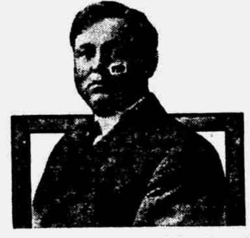
The Doctor who sees and treats each case separately—No assistants.

Scores of Cured Patients Our Best Advertisement It does not matter whether you are a man or a woman; if you are suffering from a chronic or acquired trouble. WE CAN CURE YOU if your condition is such that you can be cured. All we ask is that you call on us and get our opinion; then you will be certain as to your exact condition. We cure when others have failed and can give you the names of neighbors to whom we can refer you, and prove every statement made.