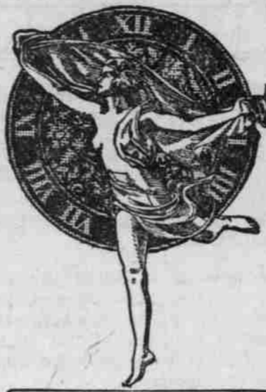
LADY MAXIM "Most Beautiful Watch in the World"

WHAT would be more acceptable as a Christmas gift than one of these beautiful LADY MAXIM Watches? They are as serviceable as they are beautiful—a constant reminder of your thoughtfulness.