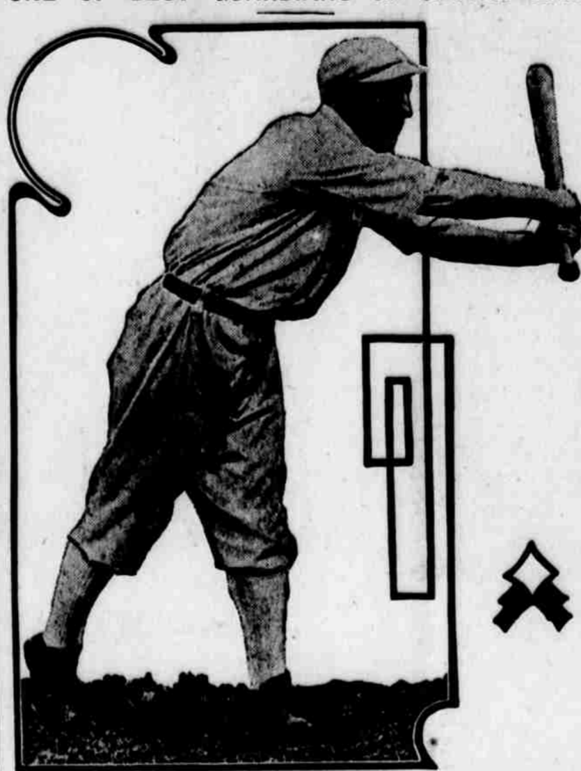
Bill Sweeney of Boston Braves.