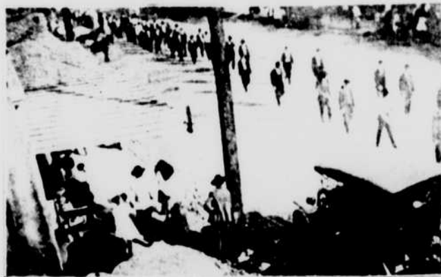
A STRIKERS' PARADE

When the Mississippi River was struck by an epidemic of strikes, the property of the Mississippi was struck by an epidemic of strikes. The strikers would not work, and the property of the Mississippi was struck by an epidemic of strikes. The strikers would not work, and the property of the Mississippi was struck by an epidemic of strikes. The strikers would not work, and the property of the Mississippi was struck by an epidemic of strikes.