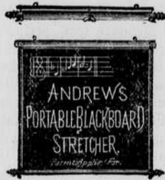
ANDREWS PORTABLE BLACKBOARD STRETCHER.