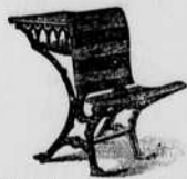
Triumph School Desk Dovetailed Together.