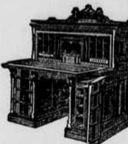
Polygon Office Desk.