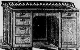
Low Office Desk.