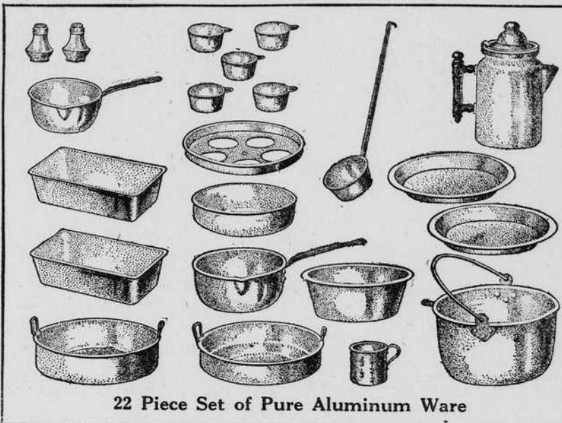
22 Piece Set of Pure Aluminum Ware

Cole's Hot Blast Fuel-Saving combustion, Cole's Smokeless and Odorless Broiler and Toaster that broils meats to a queen's taste, Cole's Automatic Fresh Air Oven that bakes evenly on all sides, and the many other Special and Exclusive Features, make Cole's Hot Blast Range the most durable, the most economical, and the greatest time and labor saving range ever placed on the market.