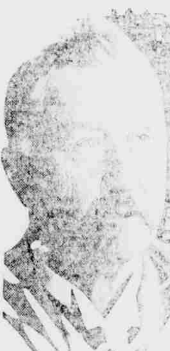
Latest portrait of Dr. Fehrenbach, new German chancellor, who has been at Spa for some time, meeting the allied premiers who are arranging terms for the payment of reparations.