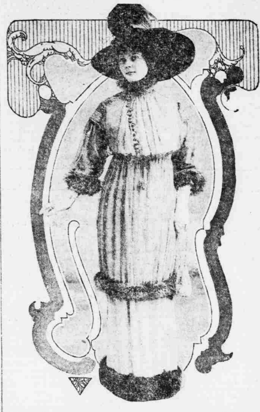
Chic Velvet Model For Milady When She Plays Bridge

THE season's tendency toward the use of fur trimmings is distinctly seen in this costume of velvet and chiffon designed for an afternoon bridge party. The edging of skunk fur gives a piquant touch to the tunic of golden brown chiffon, which is mounted over a skirt of matching velvet.