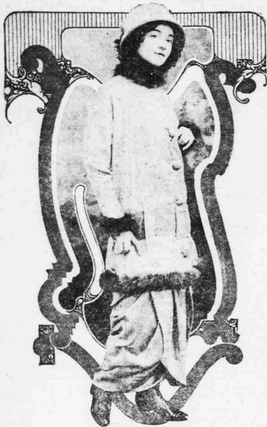
This Miss' Street Suit Is Delightfully Ingenuic

YOUNG girls this fall have some mighty good looking fashions that are youthful and at the same time extremely smart. The illustration shows a dainty little suit of navy blue duvetyne trimmed with bands of fox fur.