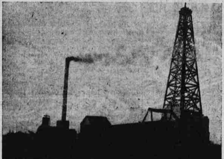
Seward County Oil & Gas Company's Well No. 1—Now drilling—Location NE 1/4 of NE 1/4, Section 20, Township 33, Range 33, 8 1/2 miles north of Liberal. This well is being drilled by local capital. They are in a financial condition to make a thorough deep test. They have now made definite contracts for that purpose, which contracts are being fulfilled as rapidly as conditions will allow. Watch your daily newspapers for reports on this well. We are looking for favorable results in the near future.

The Beaver Oil & Gas Co., composed principally of Liberal people, with head offices at Liberal, are drilling a deep test southeast of Guymon, Oklahoma, on a location 27 miles south and 16 miles west of Liberal. They are well equipped with a combination standard and rotary rig and are making a thorough test with good results.