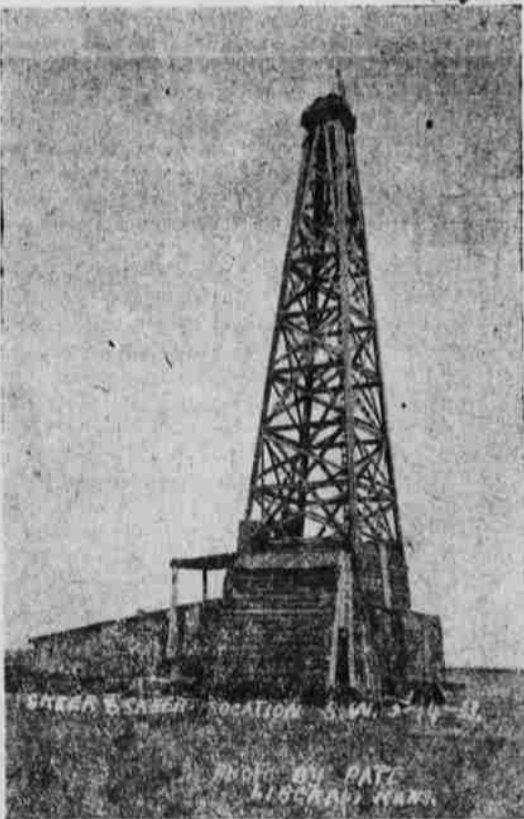
Skaer & Skaer Rig No. 1—Located on SW 1/4 of SW 1/4, Sec. 5, Twp. 34, R. 33; 5 miles north and 1 mile west of Liberal. This location is on a good block of leases but no drilling yet commenced.