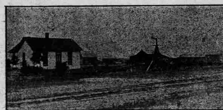
The above is a photograph of the farm residence of B. F. Bisbee, who resides 2 1/2 miles south east of Plains. Mr. Bisbee owns 800 acres of land in this place which is utilized in farming and grazing. He raised 2600 bushels of wheat and barley this year, owns a fine bunch of high grade cattle, fattened on buffalo grass. This is a sample of what can be done in drought-stricken Western Kansas.