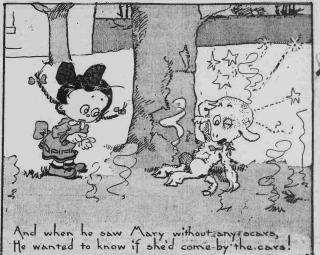
And when he saw Mary without any scars, He wanted to know if she'd come by the cars!