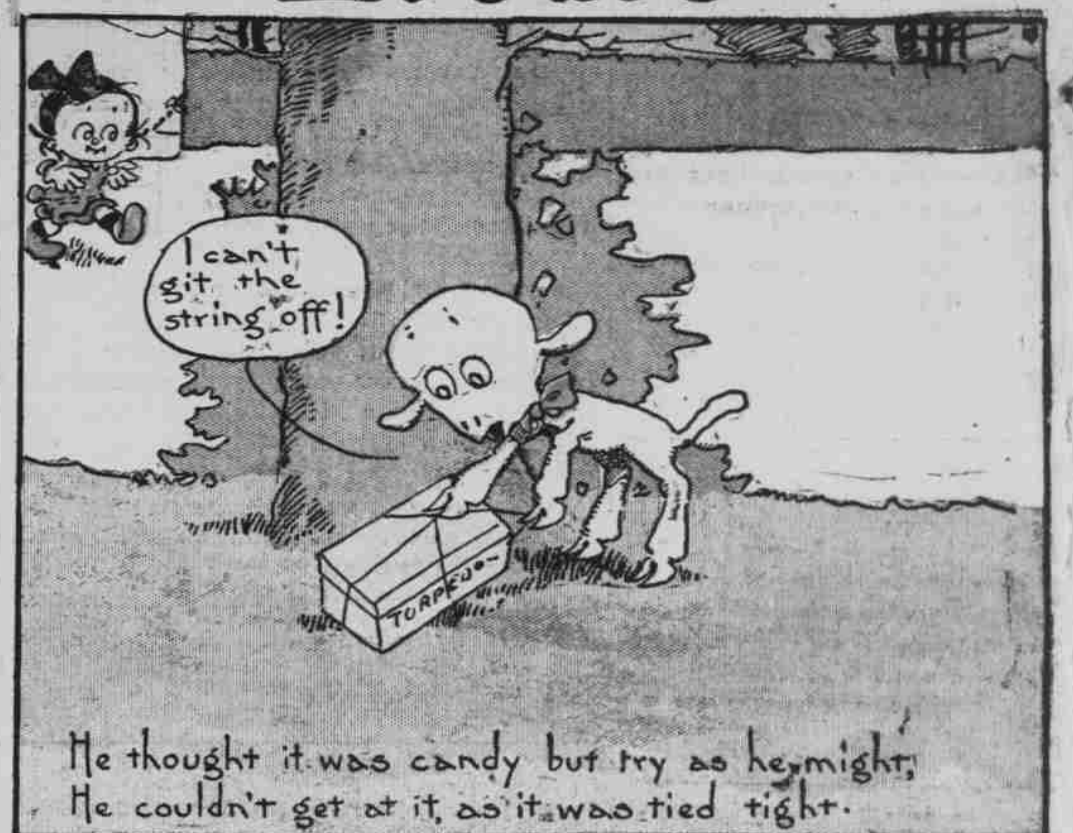
He thought it was candy but try as he might, He couldn't get at it, as it was tied tight.