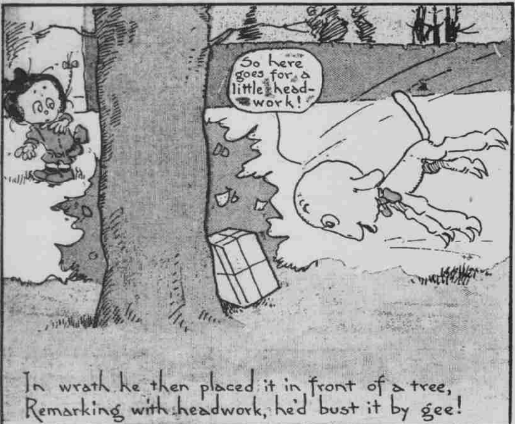
In wrath he then placed it in front of a tree, Remarking with headwork, he'd bust it by gee!