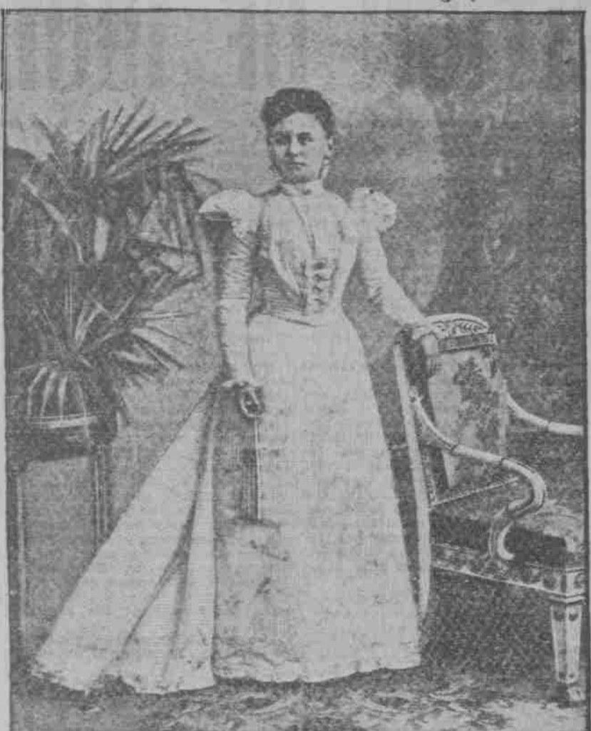
Here is the latest photograph of the girl Queen of Holland. When Europe has no other gossip to occupy its time...

leaves no stain, a sometimes happens when black or colored gloves are worn.