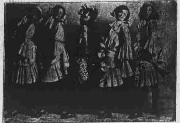
WITH THE SHOW "BEAUTIFUL"