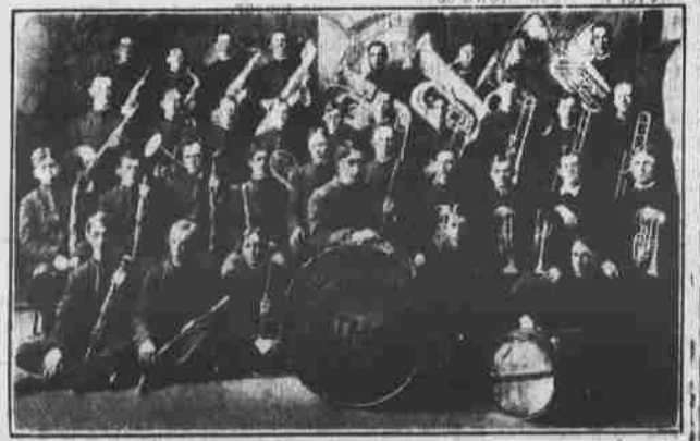
PARKER MILITARY BAND