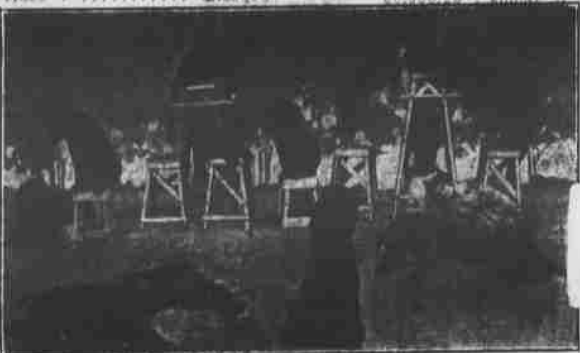
IN THE PARKER JUNGLE SHOW