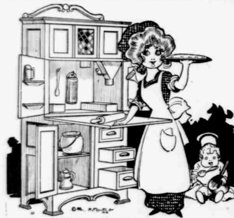
It's a STEP SAVER.