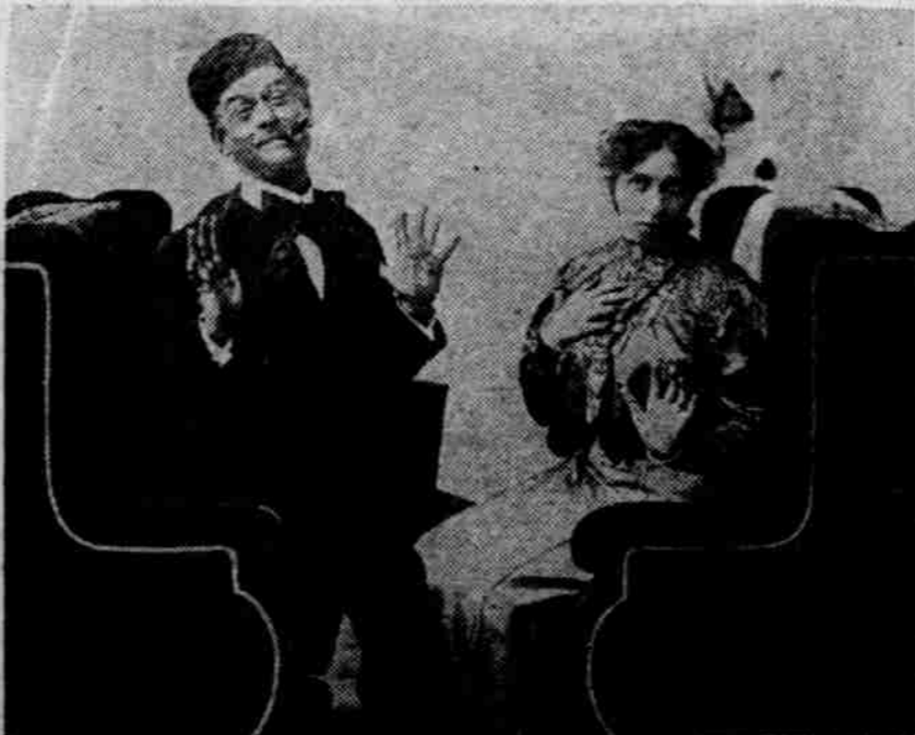
Scene from "Excuse Me" at Grand Opera House Tuesday, March 17

CORNER MAIN AND ORCHARD STREETS RICHMOND Phone 363 KENTUCKY