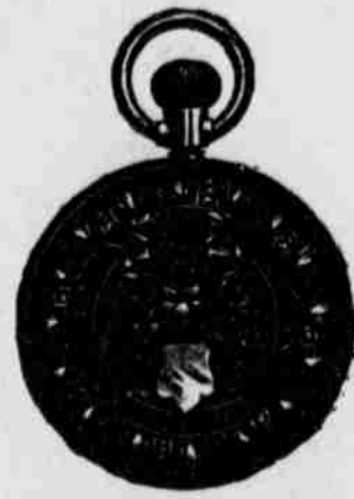
Hand Engraved, Price $8.

The GOLD FILLED cases are WARRANTED for FIFTEEN YEARS.