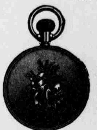
Satin Engraved, Price $6.

Designs in Plain Burnished, Plain Satin, Satin Engraved, Engine Turned and Hand Engraved.