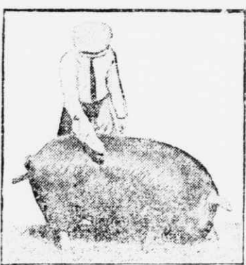
Pig Club Boy Preparing His Prize Winner for Show Ring.

Financial aid by banks helped largely to make the clubs successful. As an instance, members in Arkansas last year furnished purchased pigs to