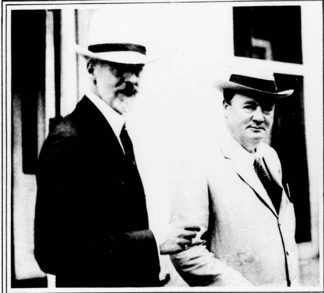
LORD NORTHCLIFFE, Right, and T. WICKHAM STEED, editor of the London Times, photographed at the White House after calling upon President Harding.