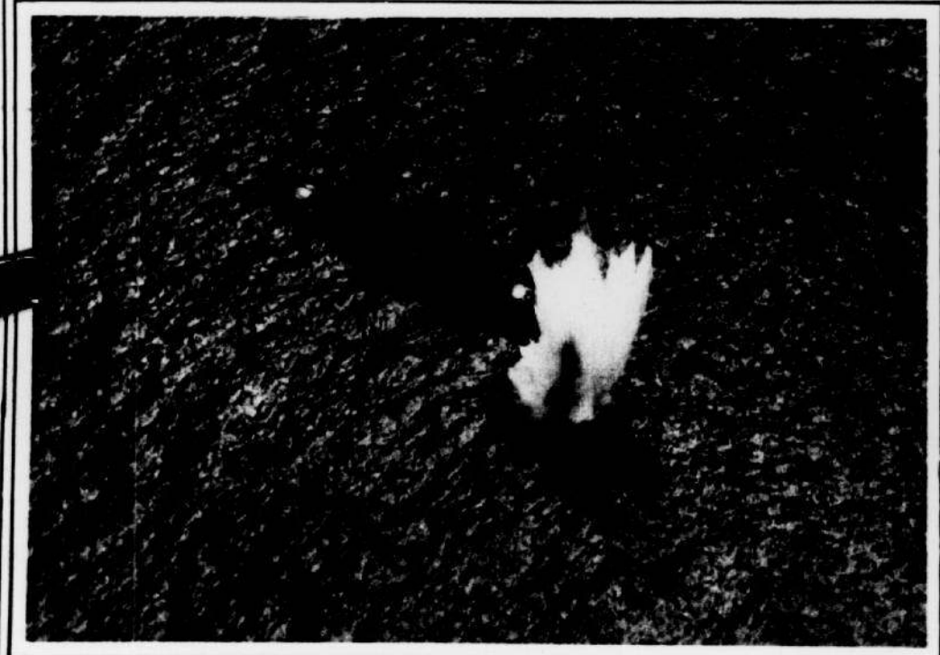
BOMBING OSTFRIESLAND.