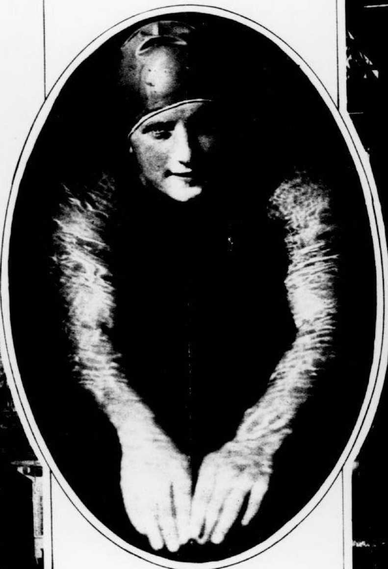
ETHELDA BLEIBTREY. Olympic record holder and World's short distance swimming champion, training at Brighton Beach for the recent swimming races. ---International.