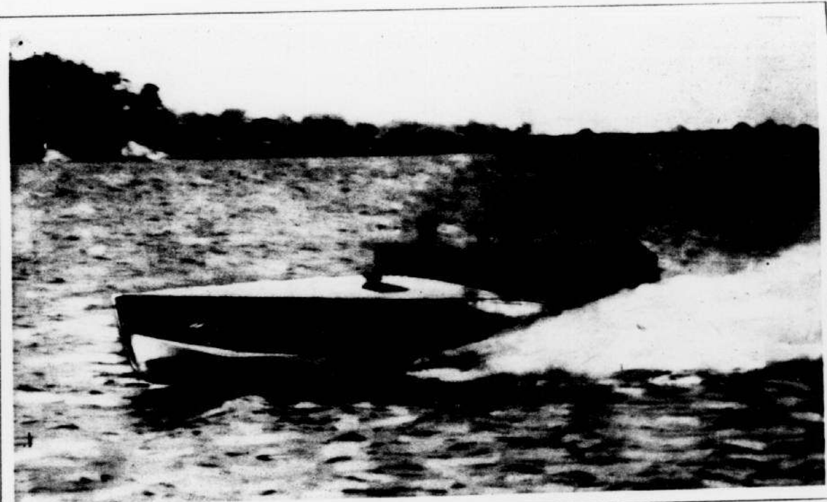
WORLD'S FASTEST MOTOR BOAT IN ACTION. Miss America II, defender of the British International Trophy, is the fastest power boat ever built. She is shown here doing 80.97 miles per hour on the St. Clair river, at Algonac, Michigan, the day she was launched.