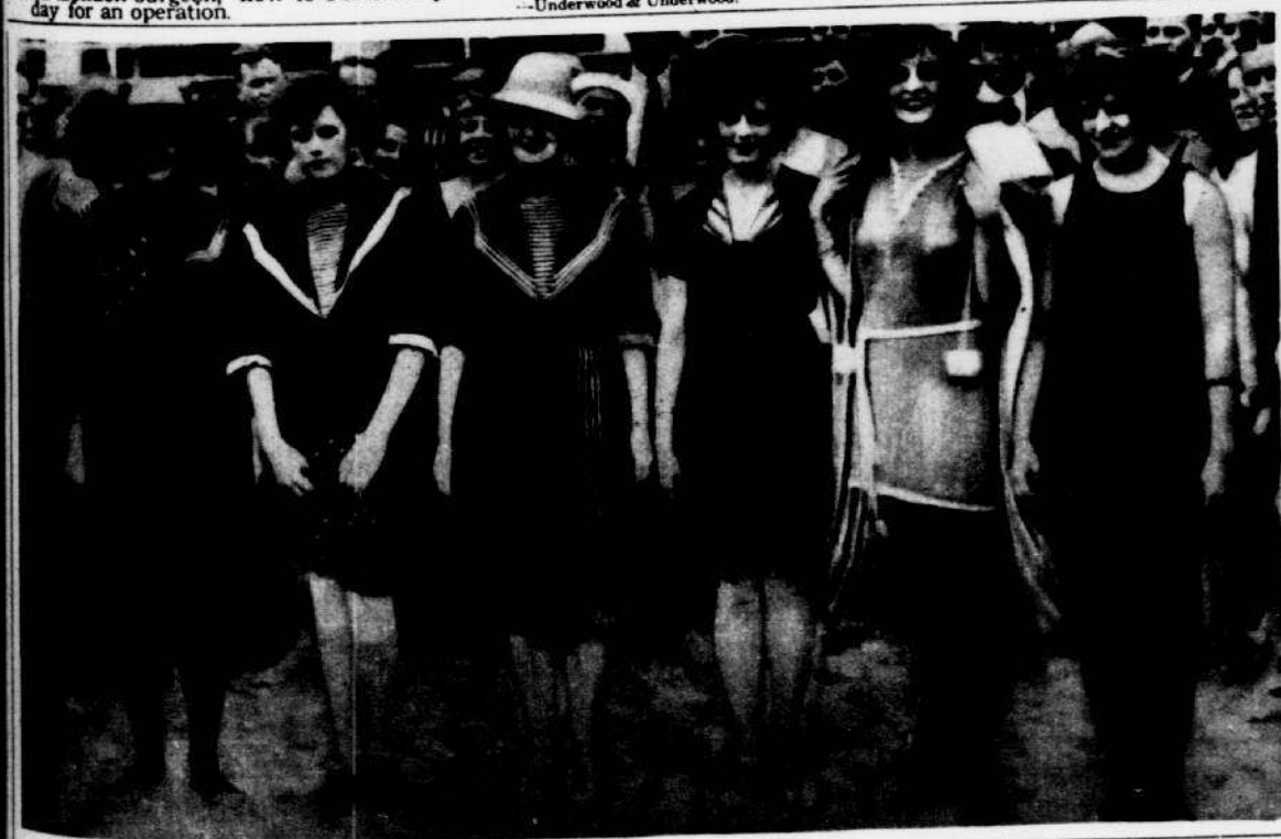
BATHING COSTUMES FROM 1871 TO 1921. This unusual group of old time bathing suits compared with those of the present day is amusing to us all.