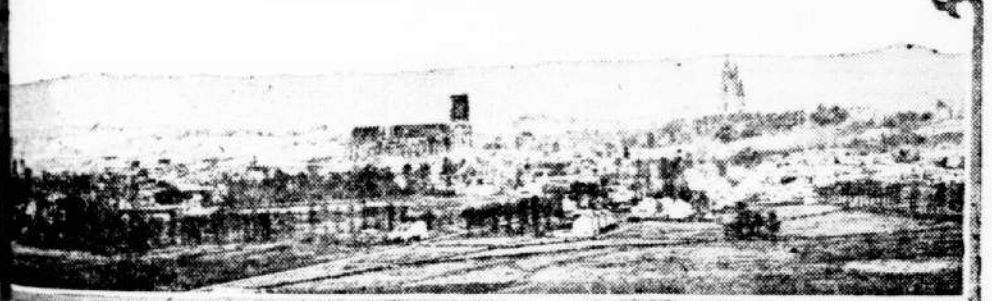
A panoramic view of the city of Soissons as it looks today. The city is situated on a hill and overlooks the surrounding country. It is now a mass of ruins—wrecked cathedrals, empty houses and debris-littered streets. The famous city, once noted for its beauty, has been the target for heavy artillery fire.