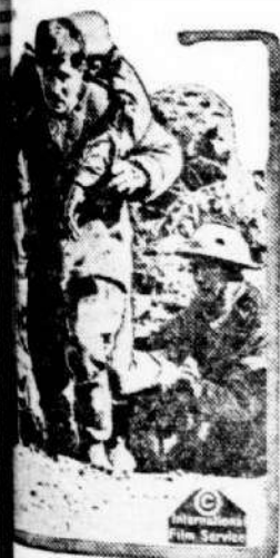
A small photograph showing one of the British soldiers in the trenches. This man, who brought the one in the manner in which he was under fire during the time of his merciful work.