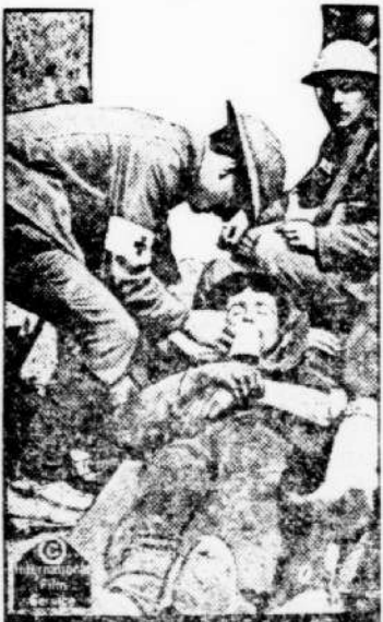
An official photograph from the western front made during the advance of the allies on the Tenth line, showing wounded British defenders of one of the trenches. Note the mushroom steel helmets worn by the men.