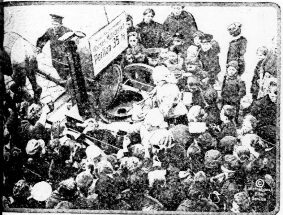
Men and children crowded about one of the German city kitchen wagons awaiting their turn to purchase for ten cents a hot dinner consisting of meat and vegetable stew and groats. By the establishment in Berlin of a central institution and seven distributing stations it is believed that fully 30,000 will be fed daily.