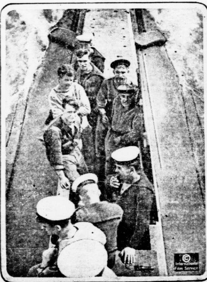
A scene aboard one of the British submarines showing the men from the engine room taking a whiff of fresh air and a cigarette.