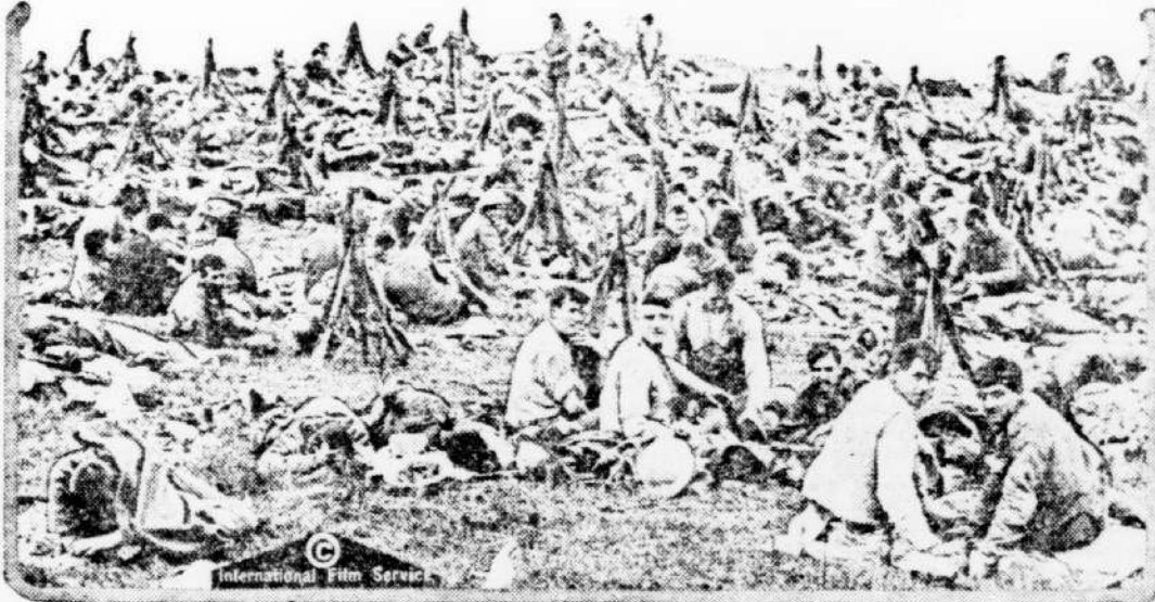
An official photograph showing the bivouac of the Royal Welsh Fusiliers on the western front.