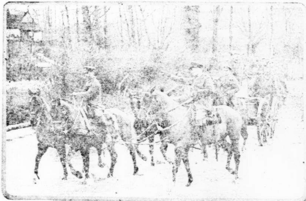
This is an exciting British battery, hurrying over the dirt road and crossing the country towards the front to rejoin the troops along the British line and to do its share in furthering the great British drive. The country shown in the photograph is typical of much of that to the rear of the fighting lines.