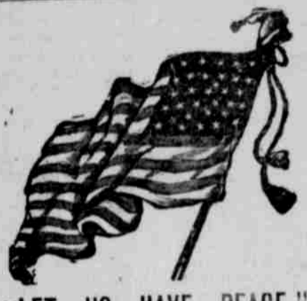
"LET US HAVE PEACE."

North-Western Time Table. TRAINS ARRIVING. No. 32...10:05 a. m. daily except Sunday No. 8...3:35 p. m. " " " No. 33...4:25 p. m. " " " No. 14...9:45 a. m. Sunday only. TRAINS DEPARTING. No. 7...9:07 a. m., daily except Sunday. Connects at Stager for points west and at Powers for points north and south. No. 31...11:40 a. m., daily except Sunday. Connects at Stager for points between Stager and Watersmeet. No. 33...5:00 p. m., daily except Sunday for Escanaba and points south of Powers. No. 34...1:55 p. m., daily except Sunday for Amasa. No. 13...6:25 p. m., Sundays only for Escanaba with connection at Powers for points south.