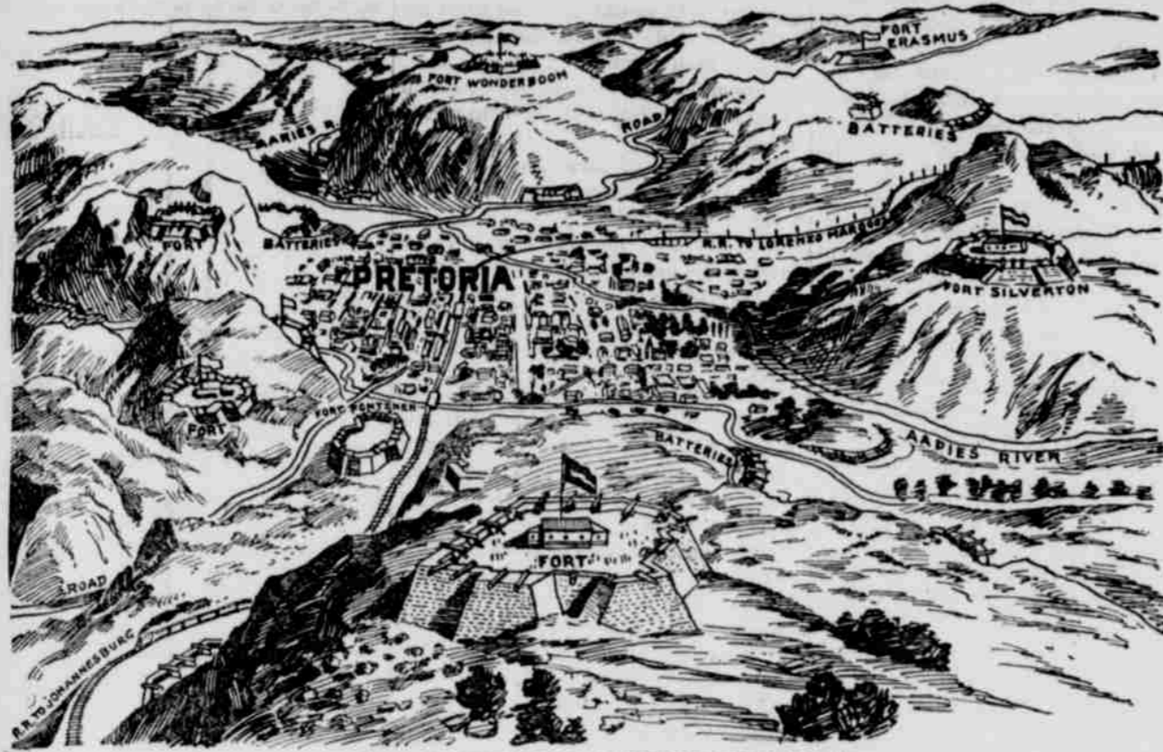
CITY OF PRETORIA, SHOWING DEFENSES.

has been that. The Cleveland book breaks the record in size, or lack of size, for printed books. There are rare little volumes engraved on ivory fastened together like a book, but they are not really books in the estimation of collectors of miniature volumes. The Bijou Almanac is a real book, printed on real paper, and bound in stiff little blue covers. It was made in London in 1836 by Schloss. It has sixty pages, a calendar for each month, and some wonderfully delicate little steel engravings. It is half an inch wide and five-eighths long, and not much thicker than the cover of an ordinary book. The owner of this little