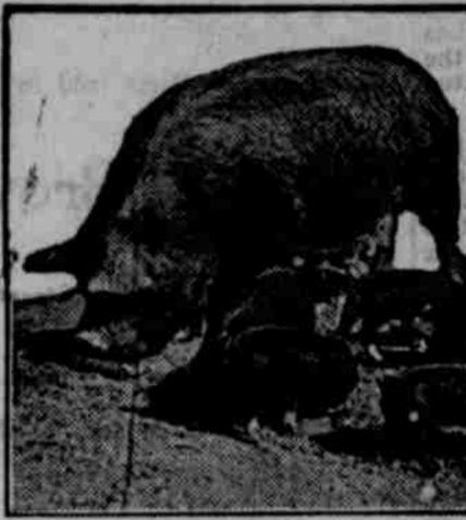
Money Makers on Any Farm.

The Indiana experiment station gives the following summary for success: First, breed for an early litter as conditions on the farm will permit;