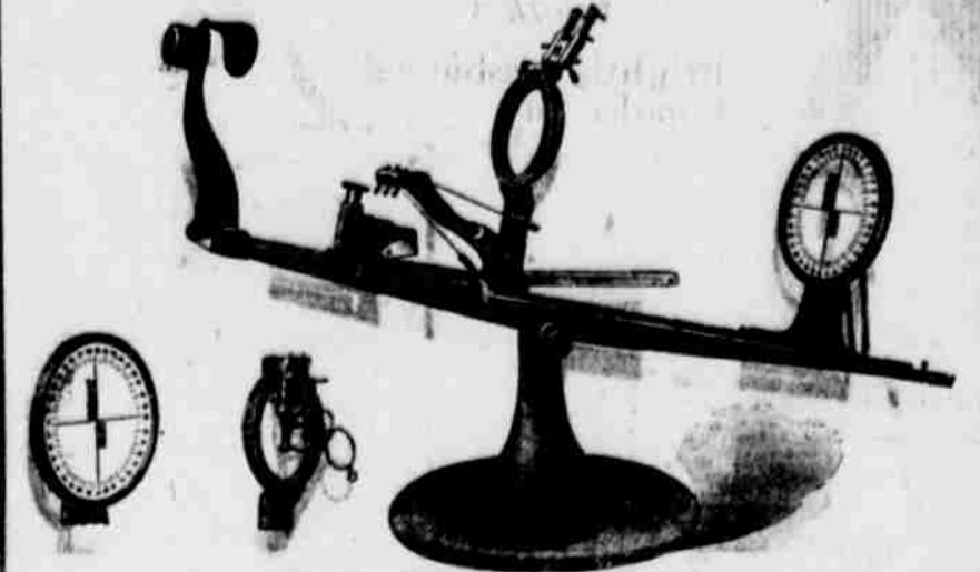
STANDARD CENTERING MACHINE

The above cut illustrates the difference between the toric and the old style or flat lens. You get perfect vision through the absolute center of a flat lens but in looking through the edges there is more distortion of the object looked at.