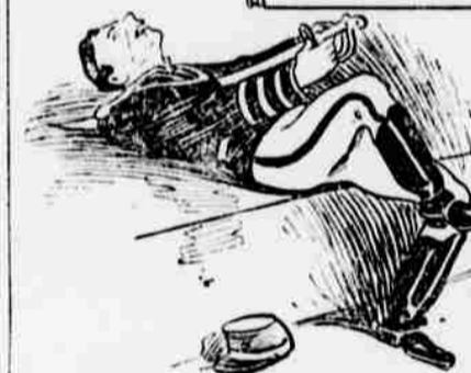
A JAPANESE OF RANK COMMITTING HARI-KIRI.