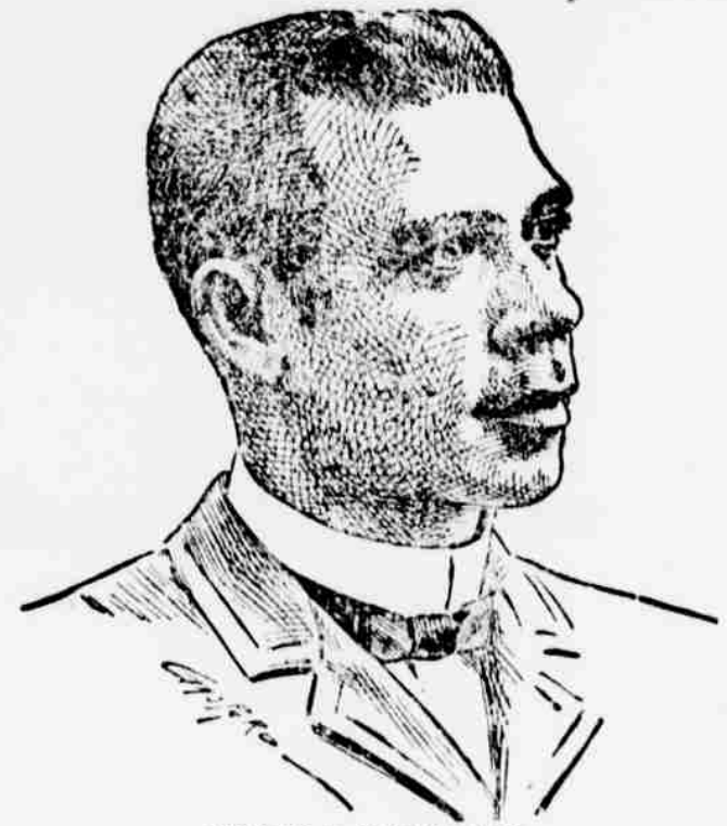
BOOKER T. WASHINGTON. Some papers are claiming that Booker T. Washington is a Democrat. This is not true. Mr. Washington, in a speech in Washington, D. C., said: "I am not a politician but I am a Republican." President McKinley and Mr. Washington are close friends.