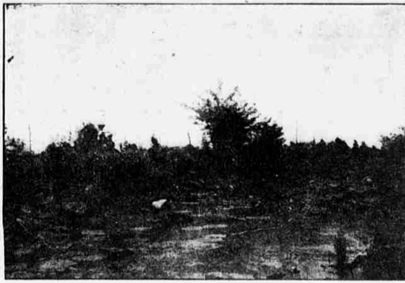
THE DITCH. The new dredge boat is now at work. The picture shows the starting point at Hayti. It is a summer scene, and shows the magnificent growth of American Lotus.

Call for a bottle of Tip Top, Lemp's latest and best special brew. Caruthersville.