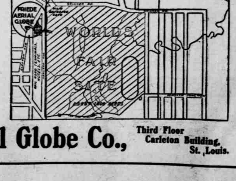
Map showing the location of the Friede Aerial Globe site in Forest Park, St. Louis.

Enclosed find $_____ for which please issue to _____ shares of stock in the Friede-Blanke Aerial Globe Co. Signed _____ Address _____