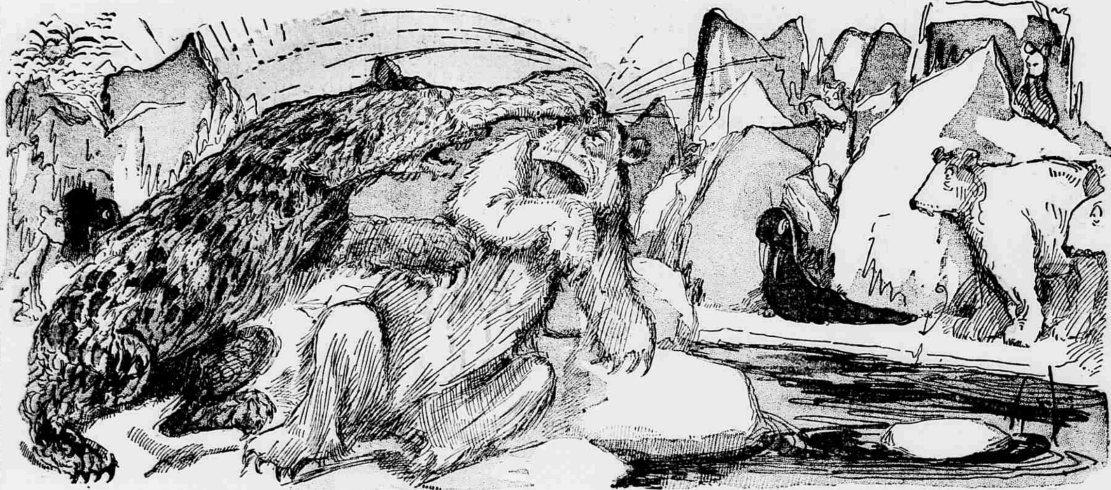
THE VICTORY OF THE BIRD-BEAR.

"The wolves were right. The king is a great magician, for even men cannot kill