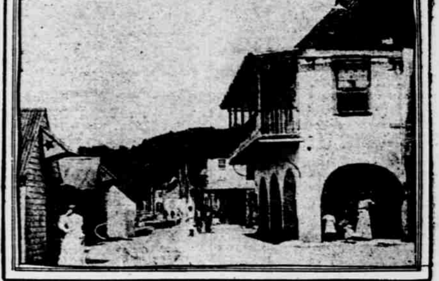
PICTURESQUE STREET IN KINGSTOWN ISLAND OF ST. VINCENTS.