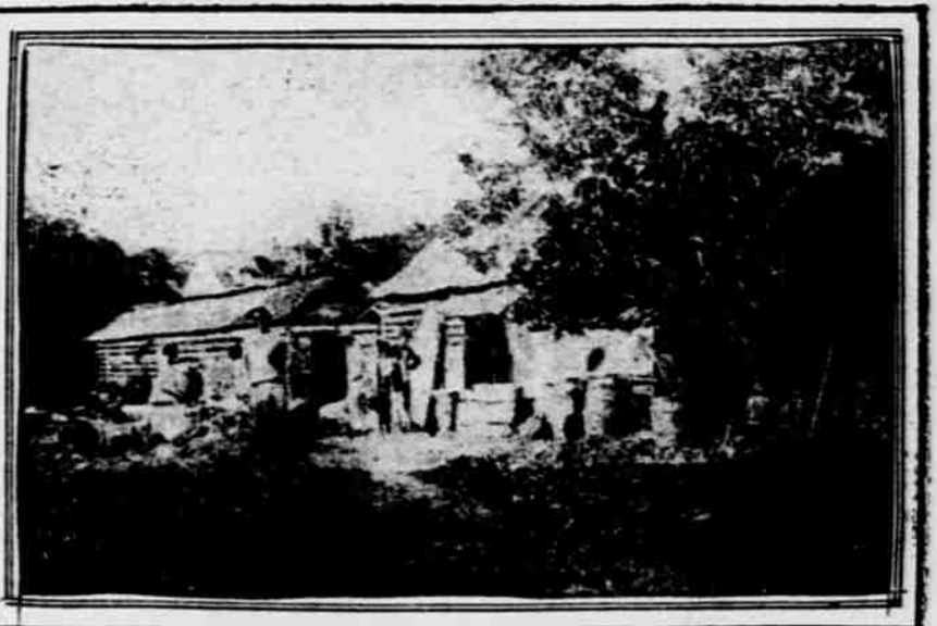
TYPICAL NATIVE HOMES IN GUADELOUPE.

Sunday came and with it the Duchess and her party, these arriving shortly after noon by the Astor yacht, the Neermah, and that in turn escorted by the torpedo boat Mermaid.