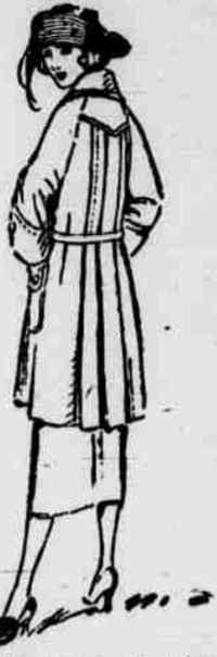
Sporty coat of fine Chinchilla in bright colors. Special price $22.00.