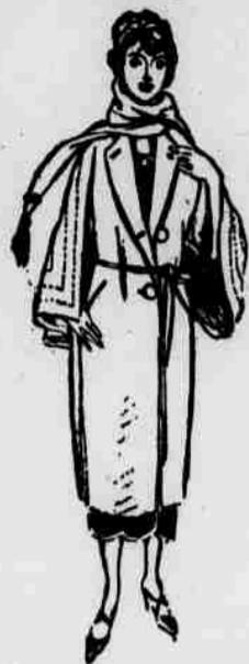
Cape coat of fine wool Velour; saddle stitched and silk lined. Special price, $30