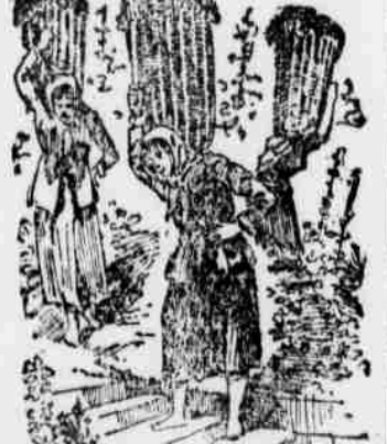
Group of Girls Carrying Wreaths Made of Grapes to the Winery to be Crushed, and Made into Wine.