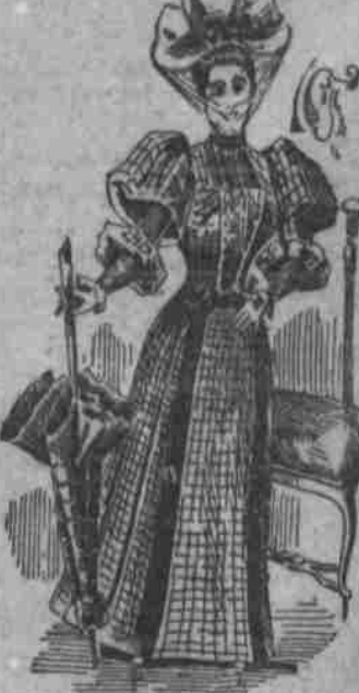
CHECKED CREPON GOWN.