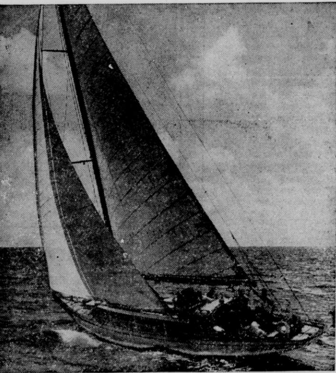
'AND ALL I ASK IS A TALL SHIP' . . . Swift and graceful as it cuts the waters off Miami Beach, the "Cyclone," Cuba's entry in this year's Lipton cup race, inevitably calls to mind the memory of Sir Thomas Lipton. Except for his tea, the amateur yachtsman asked for little but "a tall ship and a star to steer her by." Sometimes called the world's greatest sportsman, Lipton spent millions over a period of many years in an attempt to bring the yachting title to England.