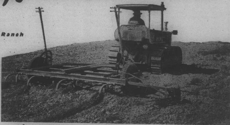
1. Chiseling and rod weeding in one operation with a D4. Covering about 8 acres per hour. This D4 has worked more than 15,800 hours.

Big job . . . but just another day's work for three men and three "Cat" Diesel Tractors . . . two early model 35 drawbar horsepower D4s and a D7! Big job . . . but low cost! 80 gallons per day of 16c Diesel fuel in the tanks of the three tractors do the job . . . that's summer fallowing for less than 4c per acre!