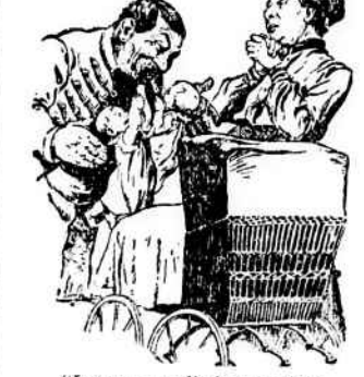
"Let go, you little rascals!"

A Melancholy Flight. This old wader seems a cozy place. Describes the various interstices which on wicked pranks intrude.